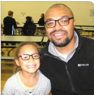
Donuts with Dad, Hollywood