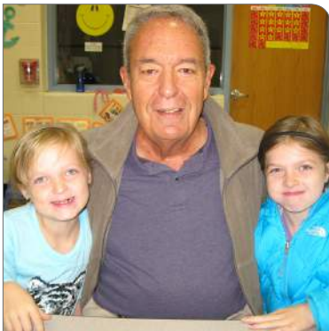
Donuts with Dad, Hollywood

Our students look forward to Donuts with Dad every year. Everyone loves to “show off” and be proud of their dad, uncle, or grandfather. Hollywood had over 350 adults attend.