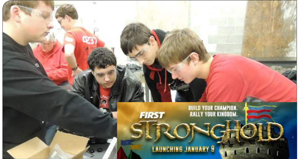
Lakeshore Robotics

The Varsity Sport for the Mind™ where every student can go pro!