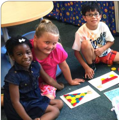
Elementary Bridges Math

Number Corner is a skill-building program that revolves around the classroom calendar. It features short daily workouts that introduce, reinforce, and extend skills and concepts related to the critical areas of study at each grade level. New pieces are added to the display each day, providing starting points for discussions, problem solving, and short written exercises. Computational Fluency is a common workout for all elementary grade levels. Activities, games, and practice pages are designed to develop and maintain computational fluency.