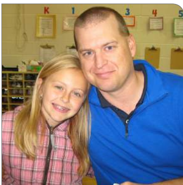
Donuts with Dad, Hollywood