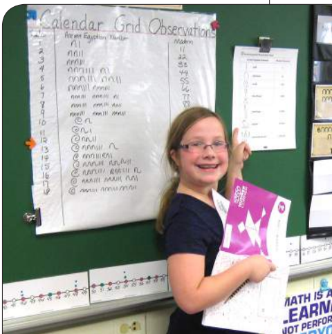
Number Corner - Bridges Math