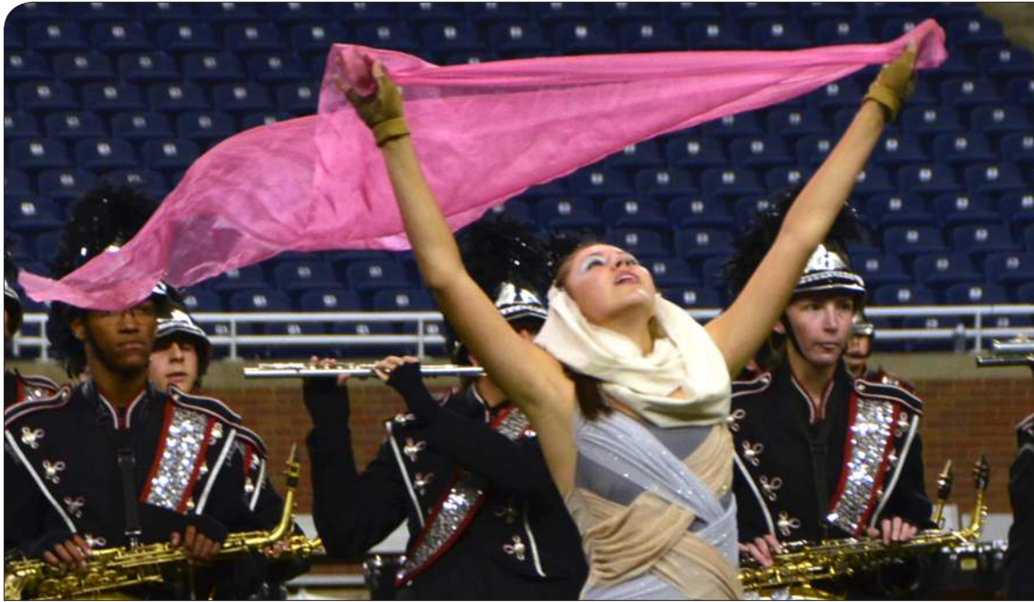
The Lakeshore Lancer Marching Band won their 4th State Championship at Ford Field.

“Lakeshore is a wonderful area to live, work, raise your children, and an EXCELLENT place for education.”